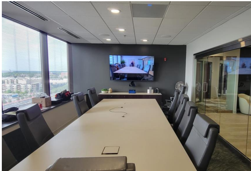
4 ceiling speakers along with ClearOne’s CONVERGE Pro 2 48VT DSP in McGuire Sponsel main conference room optimize simplicity and functionality, making conferencing experiences more positive for all participants.

The main conference room system also includes four 6-inch in-ceiling speakers to ensure every participant can hear clearly. In order to optimize the simplicity and functionality of meetings, Chrismin Communications wisely chose to specify the ClearOne CONVERGE Pro 2 48VT DSP, which enables integration with VoiP audio services so the ClearOne microphone audio can be routed to McGuire Sponsel’s familiar VoiP service. The room includes a control system as well, and the integrator added a wireless tablet to provide fast access and control of all the room’s equipment.